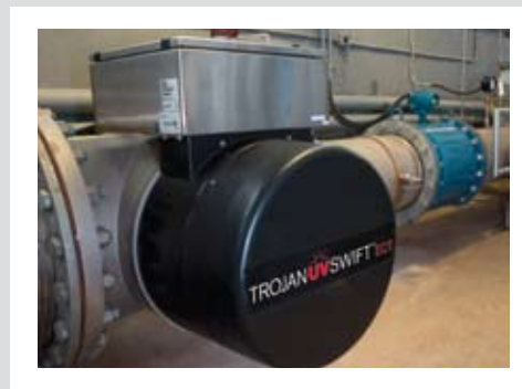
Figure 2. The City of Cornwall, Ontario, Canada currently uses the TrojanUVSwift™ ECT to provide year-round primary disinfection and taste and odor removal during intermittent T&O events with a design flowrate of 26.4 MGD (4,164 m 3 /hr).